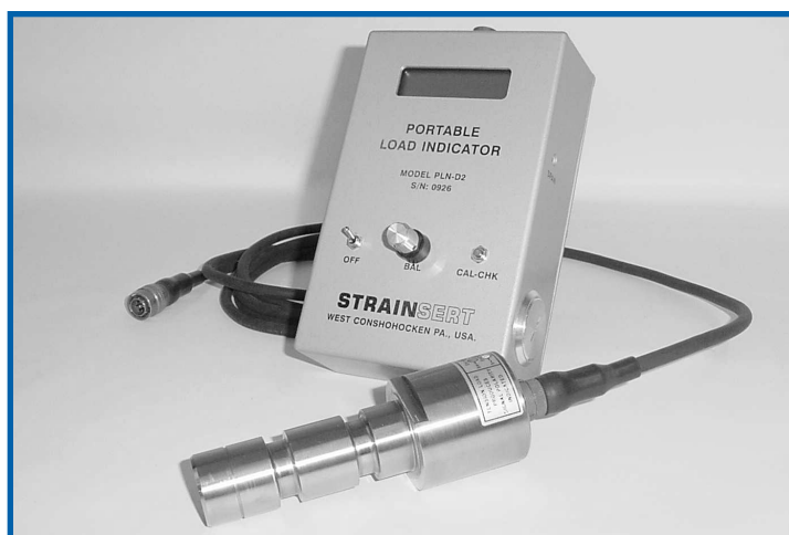
Strainert Model PLN-D2 with CPA Series Clevis Pin

Optional Protective Carrying Case – Model PLN