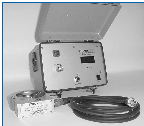
Strainert Model PLND4 with a Compression Flat Load Cell®

Replacement Battery Set – Model PLNX-233-1 (Set of 5 Nickel Cadmium “C” 1.2V)